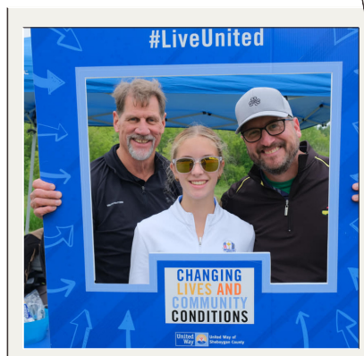
PLENCO team at PATH Mental HEalth GOLF Day