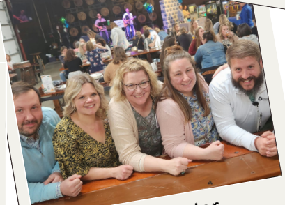
PATH Educator Appreciation Social