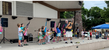
EARLY CARE & EDUCATION